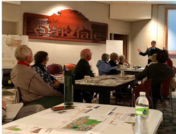
Station area planning meeting in Oakdale.

Stay tuned for upcoming e-newsletters that will share specific community meeting dates for your station area.