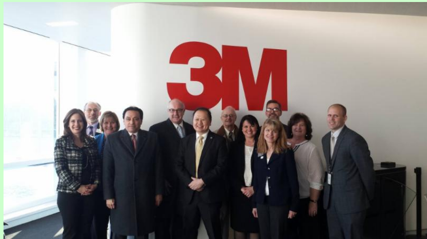
Senate Transportation Committee Tour Group at 3M.