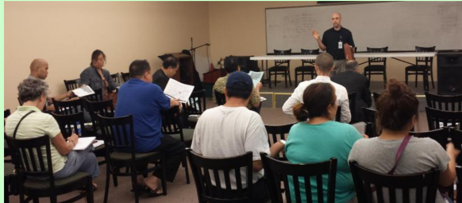
Gateway staff talks with Hmong community members.

If you know of community events that would welcome Gateway Corridor information, please send an email to gatewaycorridor@co.washington.mn.us . Thank you.